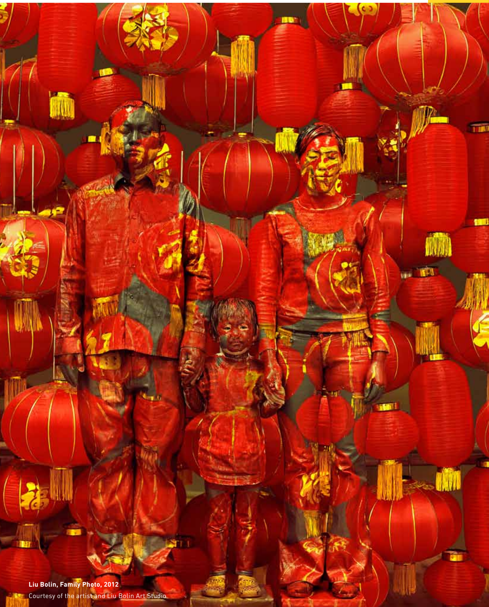
Liu Bolin, Family Photo, 2012