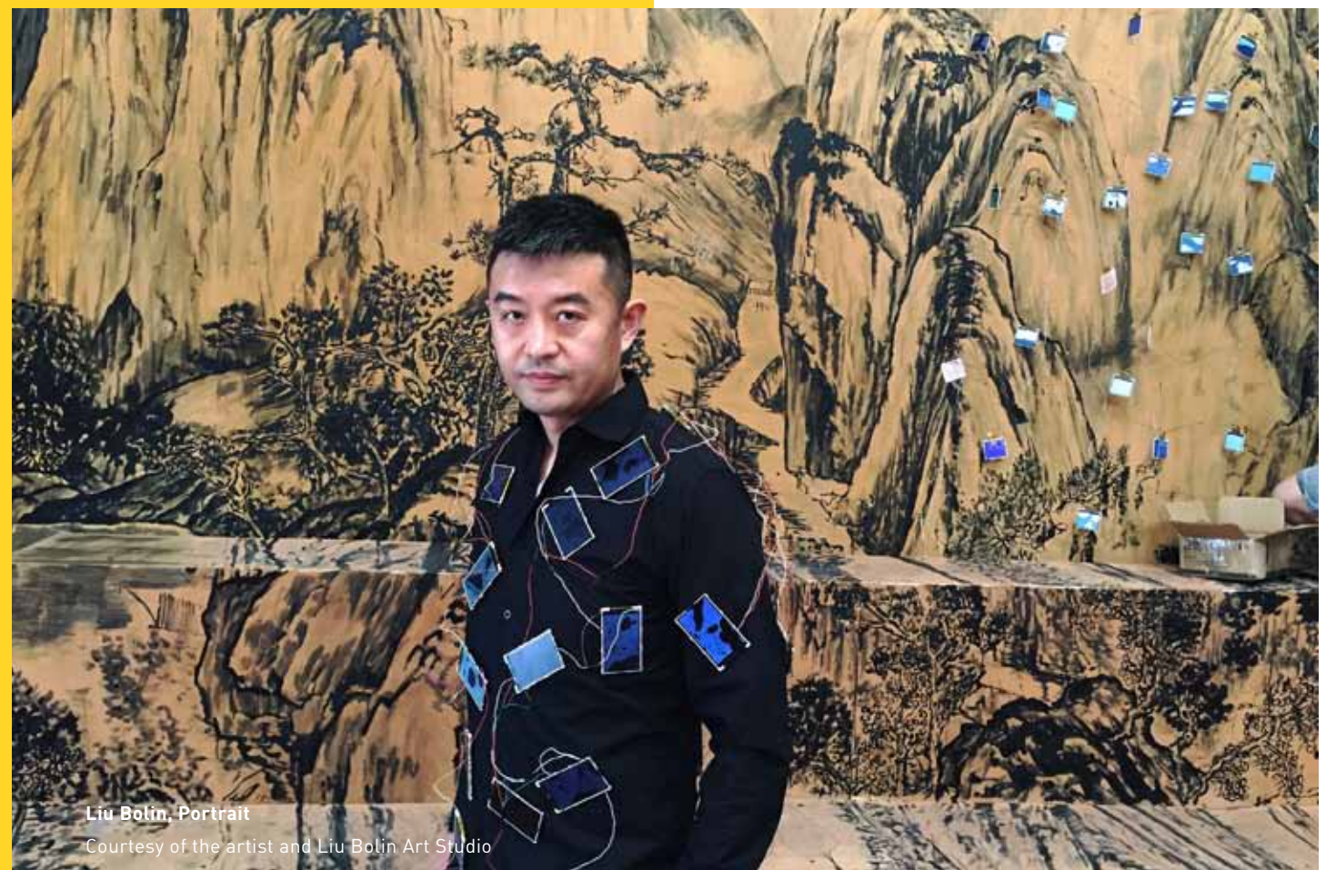
Liu Bolin, Portrait Courtesy of the artist and Liu Bolin Art Studio

One of China's most prominent living artists, Liu Bolin deftly traverses the mediums of performance, photography and social activism. Dubbed the 'invisible man' by media, Bolin dissects the tense relationship between the individual and society by 'disappearing' into environments that are sites of intrigue, contention and criticism — particularly in his home country, China. He then engages his audience by asking them to search for the invisible man — a metaphoric representation of those who have been forgotten as China rises to economic fiefdom.